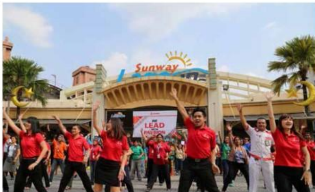
The Leading with Passion committee ignites the passion in front of Sunway Lagoon as they flashmobbed to the infectious beat of Nicky Minaj's Starship.

Sunway Group is home to some 12,000 employees. We pride ourselves on specialising in a broad range of industries across 12 business units, including Property, Retail, Leisure, Hospitality, Commercial, Education, Healthcare, Construction, Trading & Manufacturing, Building Materials, Quarry and Real Estate Investment Trust (REIT).