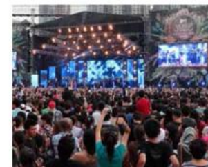
MTV fans all geared up for exciting performances ahead.

Sunway has entered into a strategic alliance with Viacom International Media Networks (VIMN) Asia, a division of Viacom Inc. and a leading provider of youth and adult entertainment content to extend the collaboration on MTV World Stage Live in Malaysia, where Sunway Resort City will continue as the event venue for the next three years, while exploring potential expanded collaborations across VIMN's brands.