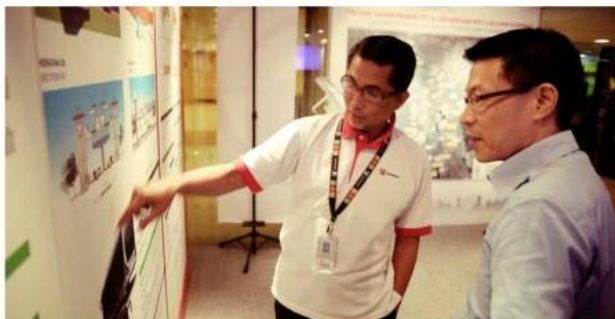
Representative of Prasarana explaining the route and the elevated system to an enquirer.