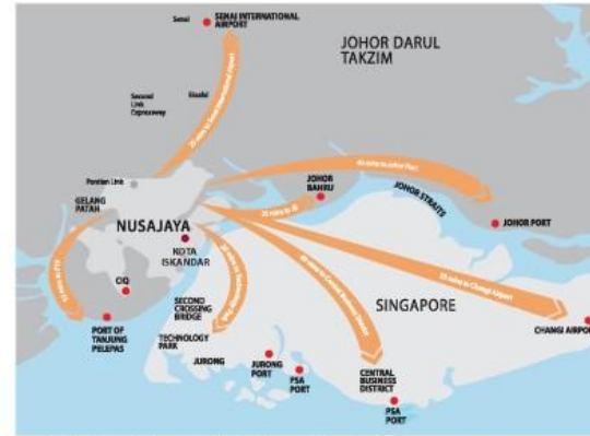
Sunway's landbank in Iskandar Malaysia is highly accessible via existing international gateways.